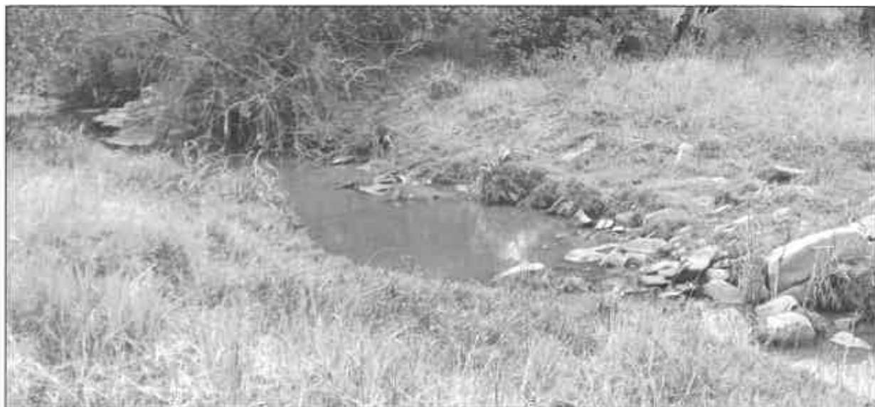
Figure 2.3 Proposed water source

There is a small stream nearby the project, the stream is considered to be insufficient to sustain the project as shown in Figure 2.3 below. However, further studies and continuous measurements of the stream flow may be required to get a more accurate overview. As a result, the ground water should be considered to supplement the stream, especially during dry season.