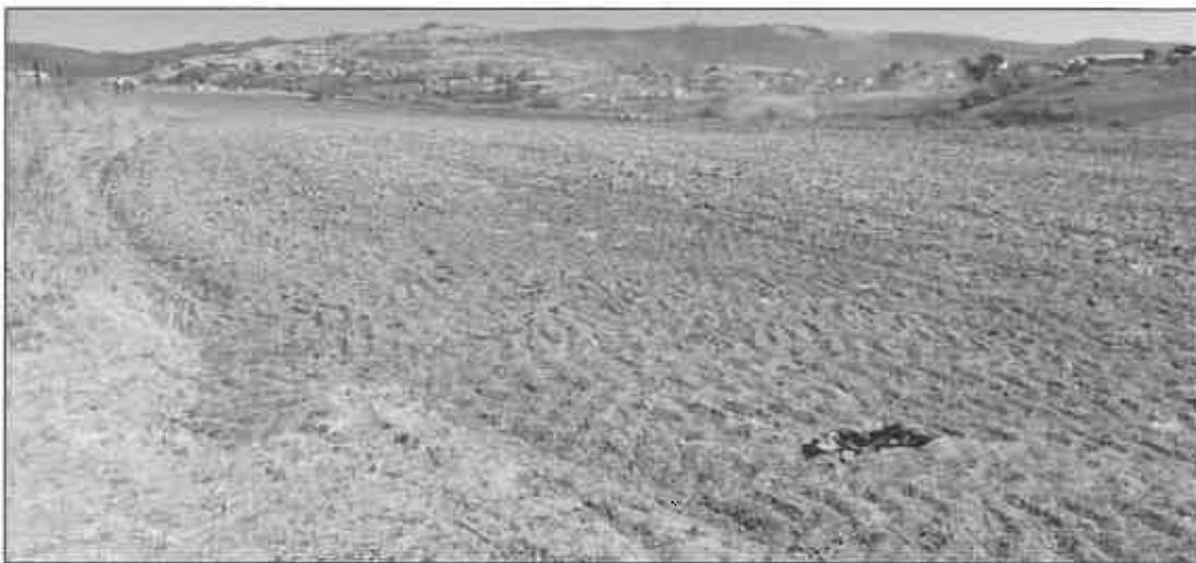
Figure 2.1 Bambanani Seme Development

The existing boundary fence is considered to be in good condition and does not require any attention. The proposed area is considered to be suitable for crop production as shown in Figure 2.1 below. The total area fenced is estimated to be approximately 15ha with section measuring approximately 10.5ha and section B approximately 4.5ha.