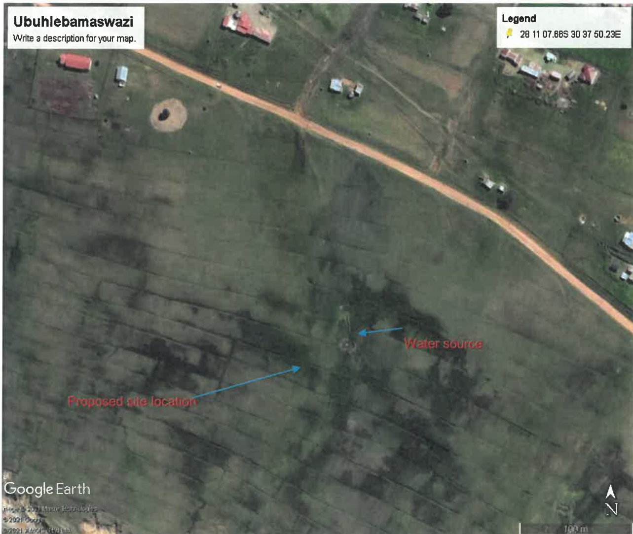
Figure 1 Locality map for uBuhle BamaSwazi diptank

2.2 The project is located in the following coordinates 28°11'07.66"S; 30°37'50.23" E