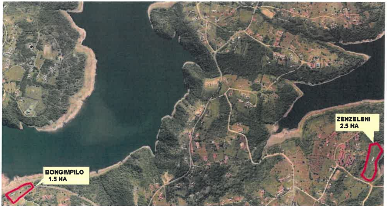
Figure 1: Locality map for Inchanga Pumping units