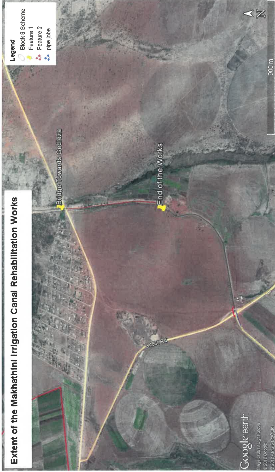
Figure 2.1 Locality Map and extent of Works