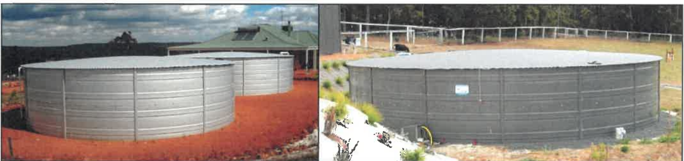
Figure 1: Examples of steel panel reservoirs