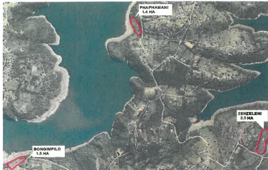
Figure 1: Locality map for Inchanga Pumping units

The above-mentioned schemes are existing schemes with irrigation systems, but the pumping units are broken therefore unable to producing vegetable. (The schemes are producing winter and summer vegetables)