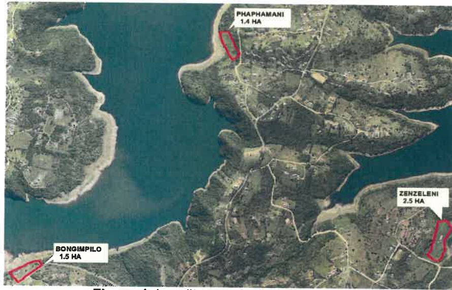
Figure 1: Locality map for Inchanga Pumping units

The above-mentioned schemes are existing schemes with irrigation systems, but the pumping units are broken therefore unable to producing vegetable. (The schemes are producing winter and summer vegetables)