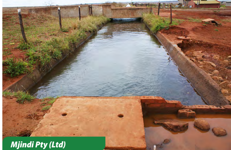
Mjindi Pty (Ltd)

The success of the Bill and Melinda Gates Foundation and World Health Organisation Rabies Eradication Programme must be celebrated today. We are pleased to announce that we celebrated a full year without a human death to rabies in July this year and two years with only one single death. In July we celebrated 45 days without an animal case (something that did not occur in over 30 years) but recently we unfortunately diagnosed 2 cases in Port Shepstone and we will strengthen our campaigns in this area as well as other priority areas.