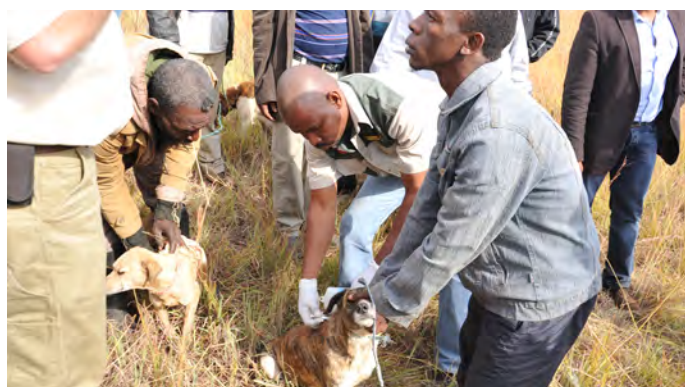
Vets Services vaccinating pets

Mjindi also plans to provide mechanization services that will assist farmers to prepare their lands and plant timeously. These services will be paid for by the farmers.