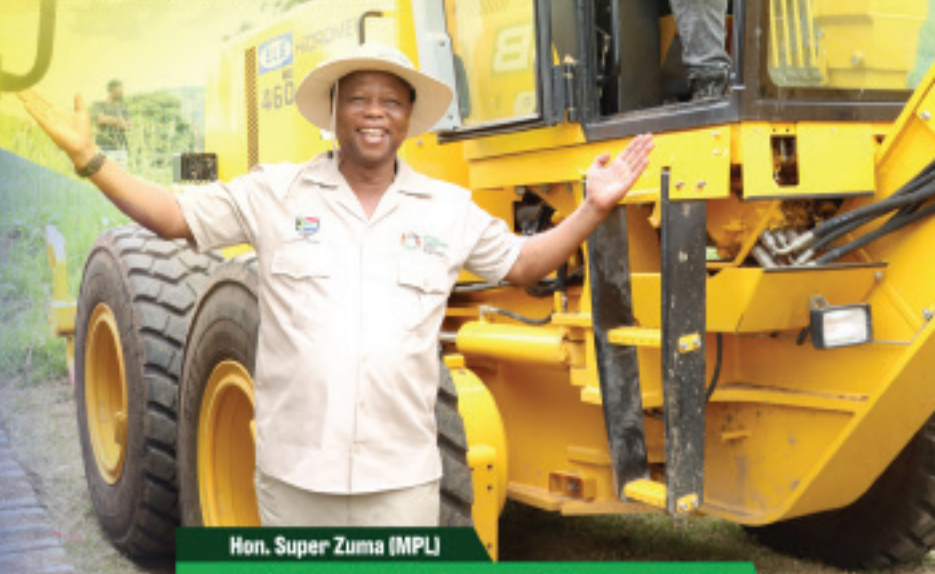
Hon. Super Zuma (IMPL)

MEC: Agriculture & Rural Development, KwaZulu-Natal