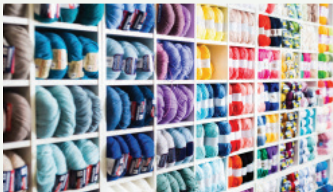
▪ Hide, Skin & Wool processing facility