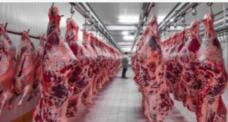
▪ Red meat hub focusing on Beef and another Red meat hub focusing on Pig and Sheep.

The total cost of all five Agri-Hubs is estimated at over R3 billion. Environmental impact assessments are at advanced stages of approval in respect of all five planned Agri-Hubs. Furthermore, Geotech studies have been conducted for most of the identified sites.