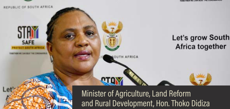
Minister of Agriculture, Land Reform and Rural Development, Hon. Thoko Didiza