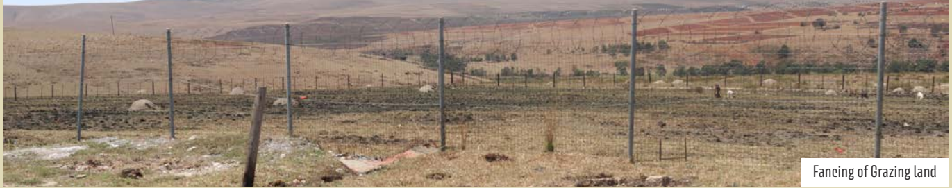
Fencing of Grazing land

Honorable Speaker, infrastructure remains the key enabler for agricultural growth and the unlocking of investment related to socio-economic agrarian transformation in the province.