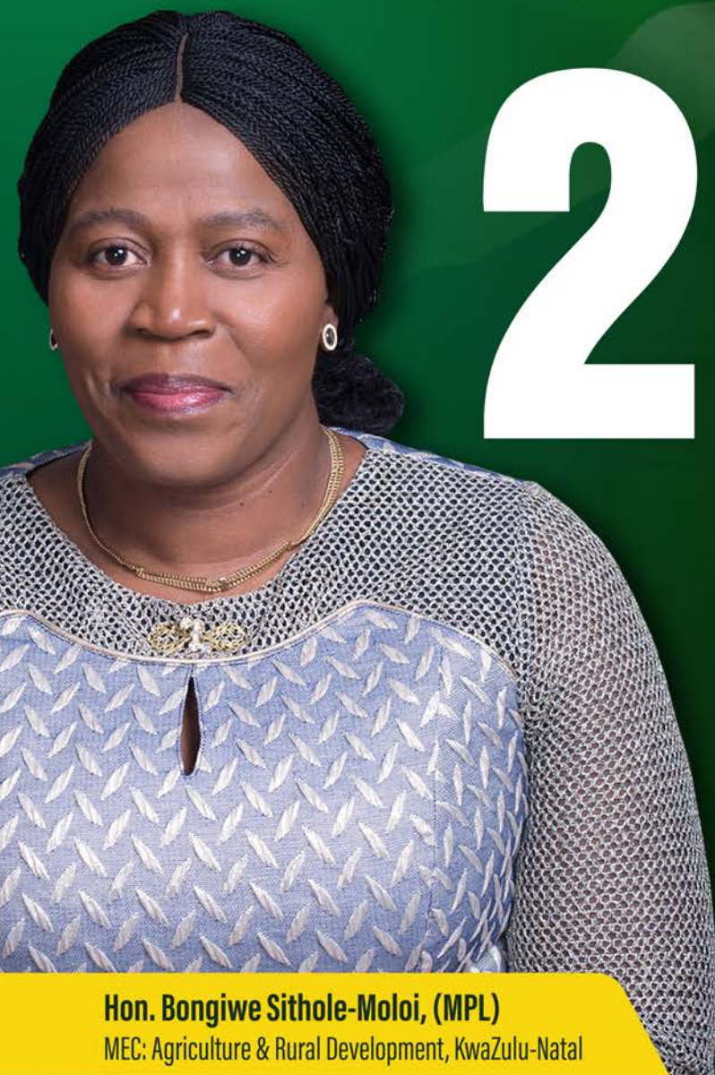
Hon. Bongile Sithole-Moloi, (MPL) MEC: Agriculture & Rural Development, KwaZulu-Natal