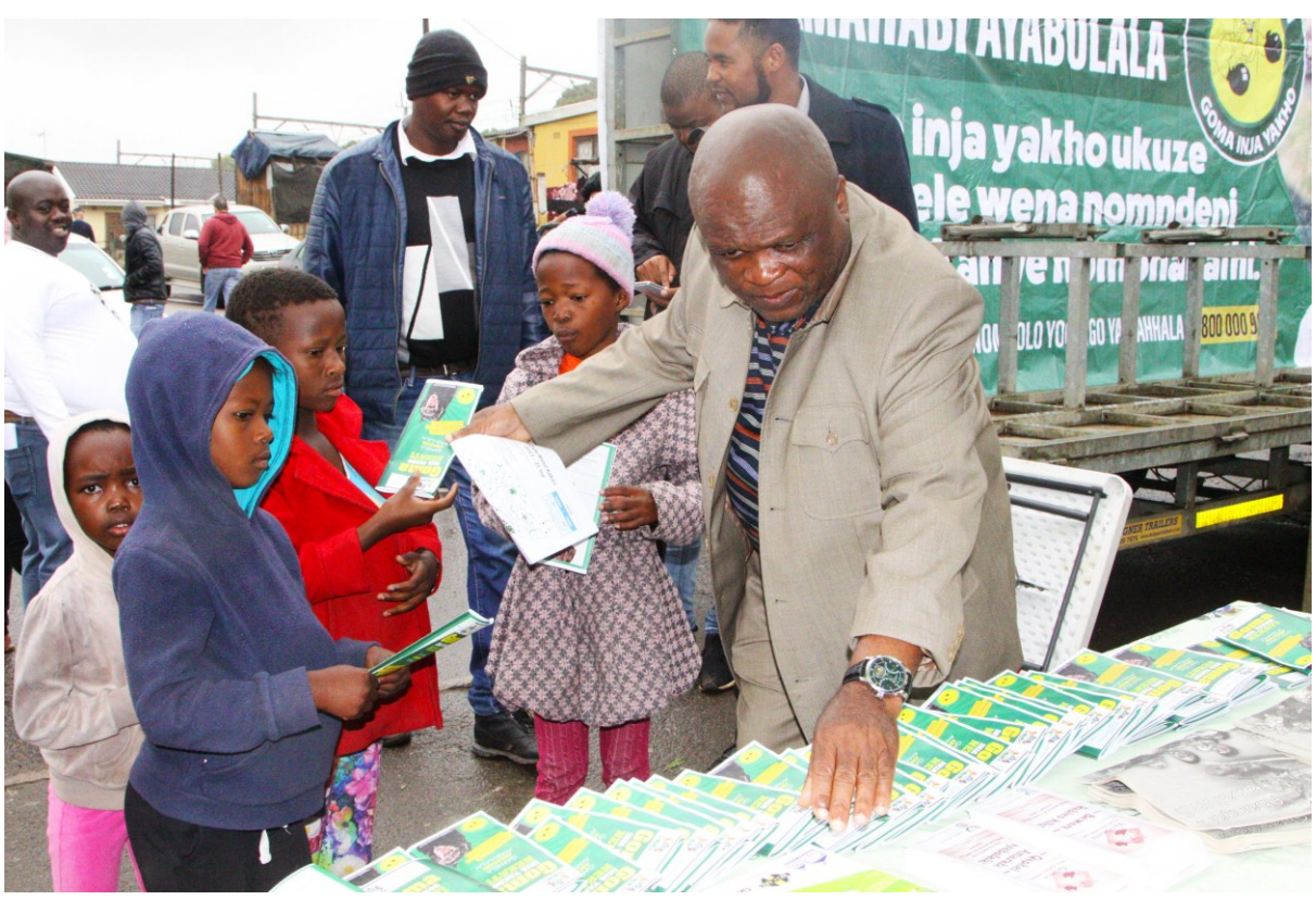
KZN DARD MEC Themba Mthembu sharing the Rabies Awareness campaign pamphlets and brochures with the local children in the area