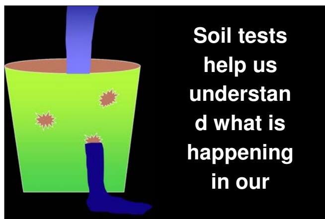
Figure 1: Soil testing lets a person understand what is happening in the soil. It shows us which holes are in our bucket so we can close them.

Poor soil fertility is one of the most limiting constraints to crop and pasture growth in KwaZulu-Natal. Soil tests indicate the amount of nutrients in the soil which are available for crop growth and reflect soil acidity levels. It can be thus be determined which nutrient is the most limiting and this one can then be corrected first. This can be illustrated by considering a bucket with holes in it. Unless the hole at the bottom is closed first, the bucket will never be filled up. And soil tests show us which hole is the one in the bottom of the bucket!