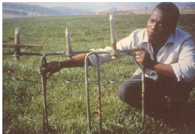
Figure 4: This picture shows 3 different sampling depth bits. The bit in the middle is the 15 cm depth that is required for taking samples for the establishment of crops. The bit on the left has been reduced to 10 cm depth with a spacer for the sampling of pastures for top-dressing. The bit on the right is 23 cm depth – which is the incorrect depth for topsoil samples.

undetected acidity in the topsoil would have decreased the yield of maize by 2.5 t/ha. Sampling to the wrong depth has thus cost more money and resulted in less yield!