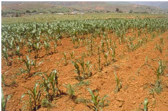
Figure 5: Where problem areas are encountered within a field, a separate sample of these areas should be taken. The area in the foreground had high soil acidity causing the poor maize growth.