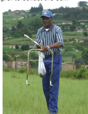
Figure 2: Using a beater soil sampler with a 15 cm bit to take a soil sample.

To take a good soil sample, you need to use a beater soil sampler. This will allow you to accurately control the depth of the soil sample and to easily take sufficient sub-samples to obtain a good representation of the field being tested. Use a clean plastic bag or bank bag on the sampler to collect the soil.