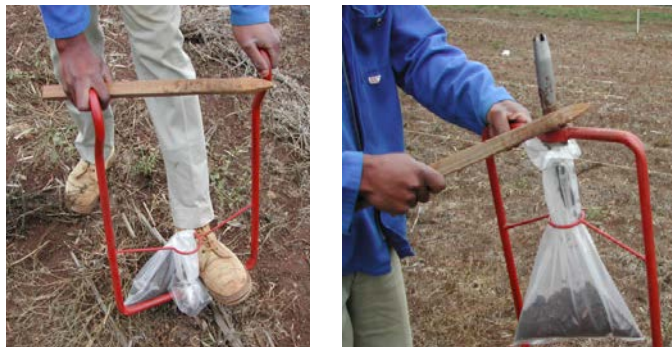
Figure 7 & 8: These show the beater soil sampler being thrust into the soil and the forcing of the sub-sample (core) from the sampling bit into the plastic bag.

(For more details on filing in the submission forms see Agri Update: Completing soil sample submission forms).