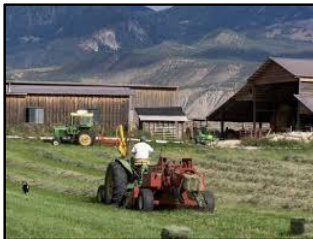
FIGURE 1: Examples of a square baler (top) and a round baler (bottom).

Do not bale grass when it is still too wet, it will spoil with bacterial or fungal growth and it may get so hot that it bursts into flame in storage. Hay can be made mechanically into small square bales, small round bales or large round bales.