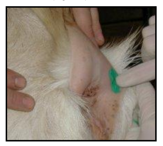
FIGURE 8: Green ink applied on the tail web

Apply the tattoo ink on the clean area to be tattooed. Plastic gloves will keep the operator's hands clean (Figure 8).