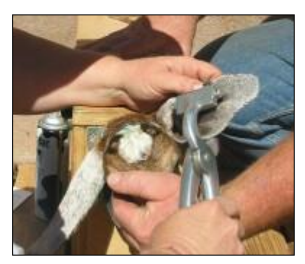
FIGURE 3: Making the imprint

Tattoo needles must make holes large enough to let an adequate amount of ink into the skin (Figure 4). If the ear/skin sticks to the needles, gently peel it off the pliers. Immediately apply more ink and rub vigorously and continuously for at least 15 seconds to ensure penetration. If each hole is not completely filled with ink, add more ink and repeat the rubbing process.