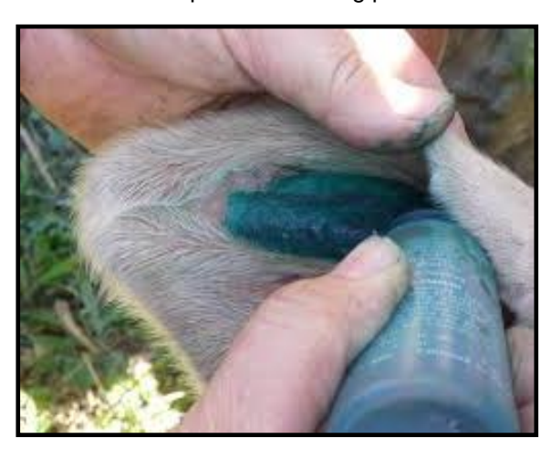
FIGURE 4: Applying the ink on the ear. In this case green ink is used

Tattoo needles must make holes large enough to let an adequate amount of ink into the skin (Figure 4). If the ear/skin sticks to the needles, gently peel it off the pliers. Immediately apply more ink and rub vigorously and continuously for at least 15 seconds to ensure penetration. If each hole is not completely filled with ink, add more ink and repeat the rubbing process.