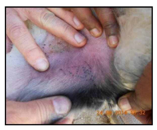
FIGURE 6: The finished flank tattoo

7. Follow the same procedure as described for ear tattooing.