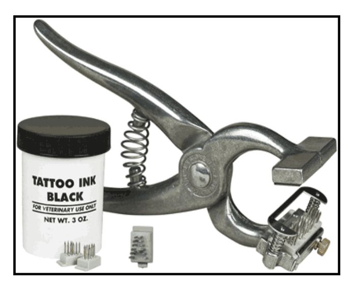
FIGURE 1: Tattoo applicator and ink

Inks are available in black, green, red and white and in paste or liquid form. On light-skinned animals the color of the tattoo is less important. Black ink is most commonly used in white-skinned breeds and green in dark-skinned breeds. On such animals holding a flashlight at the back of the ear will help when reading the tattoo.