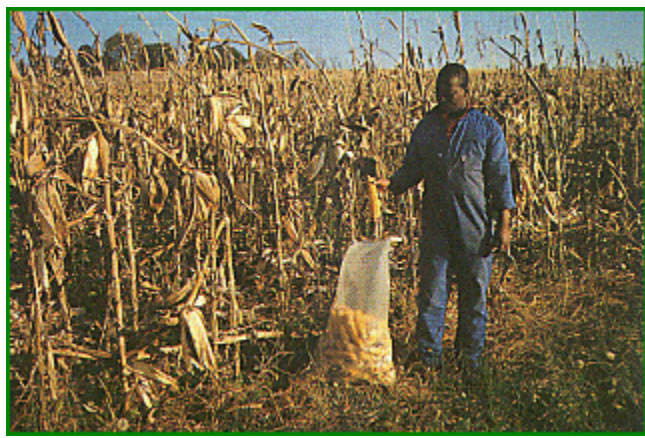
Harvesting a good crop of maize produced with combination of manure and fertilizer

A 'scoop' made out of plastic five-litre bottles or five-litre oil cans would be ideal for measuring out manures.