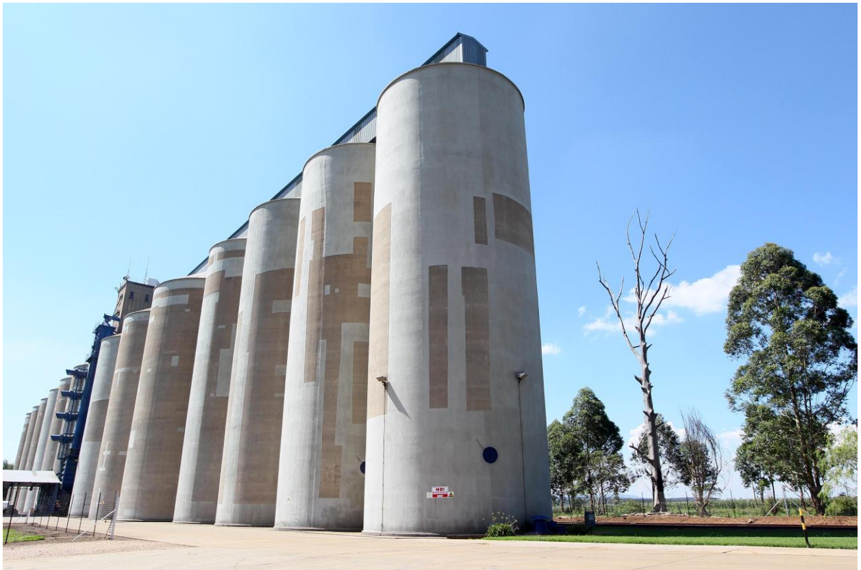
Mizpah Silo Plant