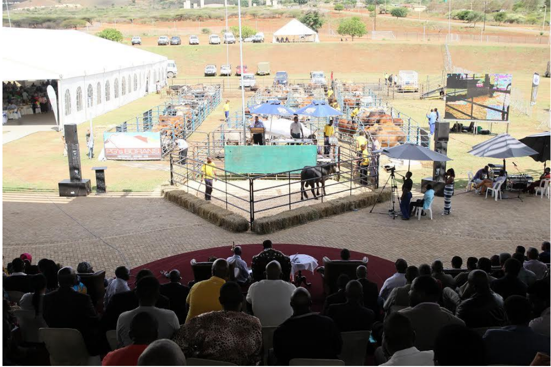
Participants at the livestock auction