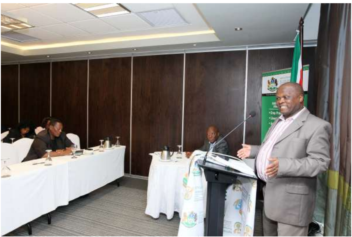
MEC Themba Mthembu addressing Amakhosi on Agricultural issues