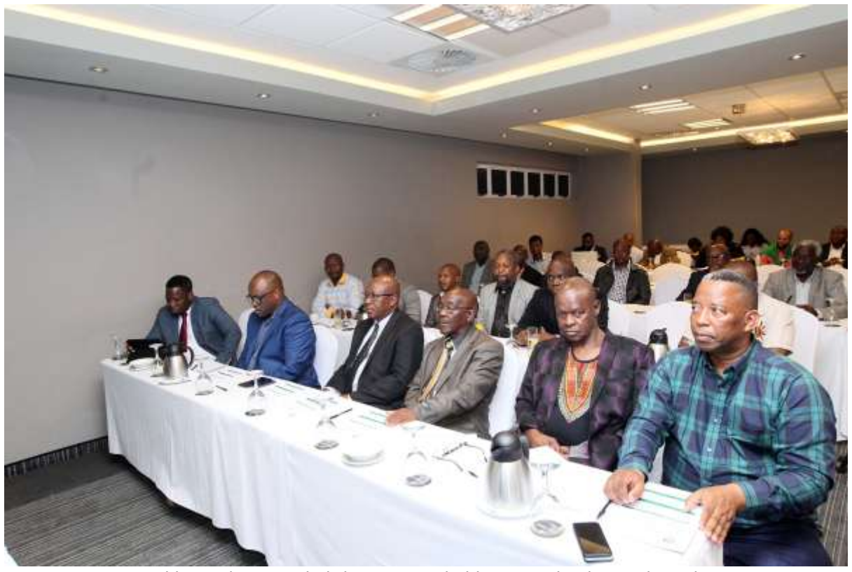
Amakhosi who attended the meeting held at Coastlands Hotel, Durban