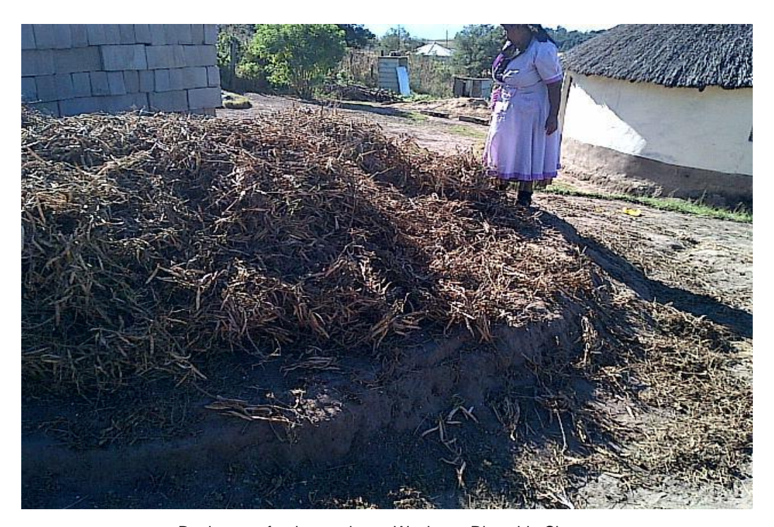
Dry beans after harvesting at Wosiyane Riverside Cluster