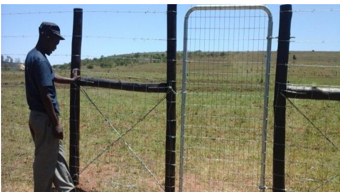
Fencing at Wosiyane Riverside Cluster