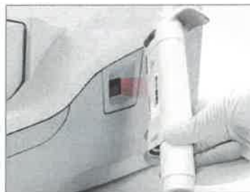
2. Scan pipette