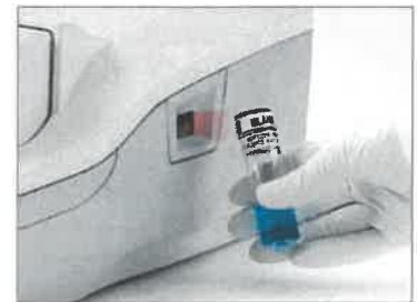
3. Scan calibration solutions.