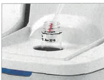
4. Dispense samples.