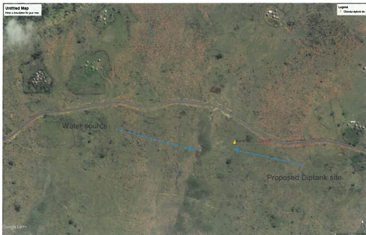
Figure 1 Locality map for Obemba diptank

2.2 The project is located in the following coordinates 29°08' 58.16"S; 30° 45' 13.4" E