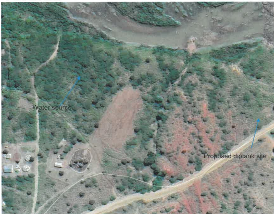
Figure 1 Locality map for the proposed Magobhe diptank site

2.2 The project is located in the following coordinates 28°51' 03.58"S; 30° 55' 23.52" E