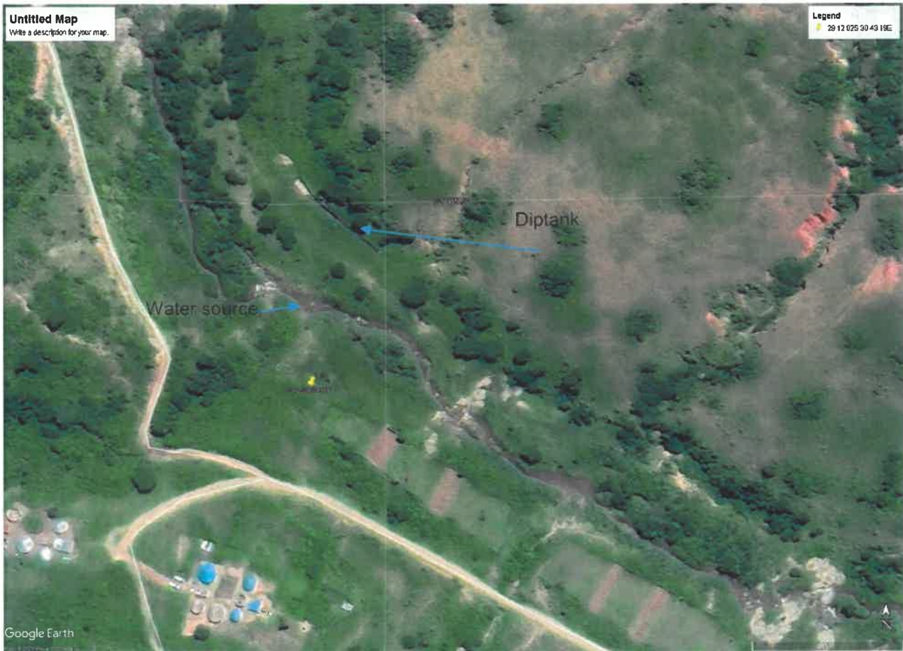
Figure 1 Locality map for Mdlelanto diptank

2.2 The project is located in the following coordinates 29°11' 58.68"S; 30° 43' 18.79" E