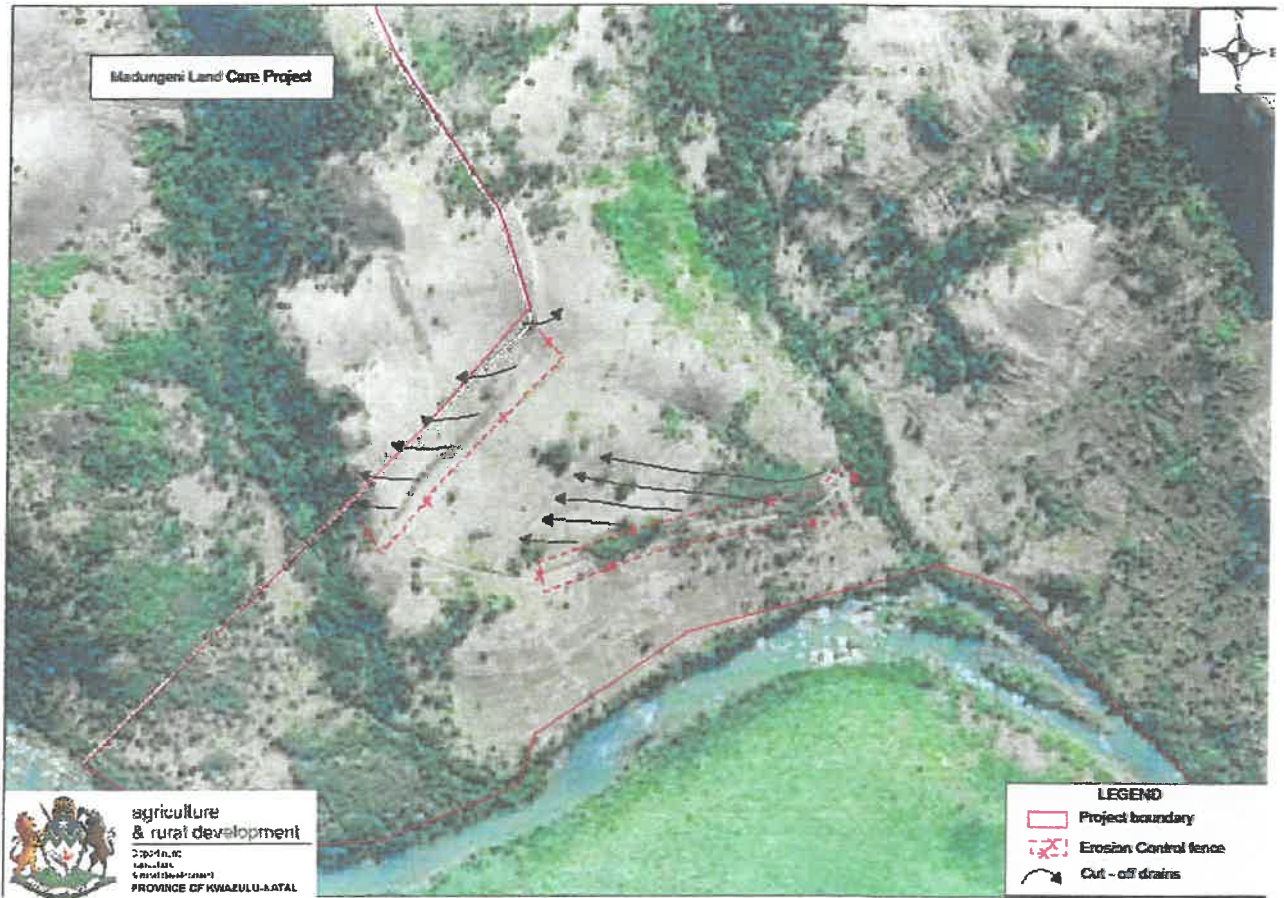
EROSION CONTROL WORKS AT MADUNGENI LAND CARE PROJECT