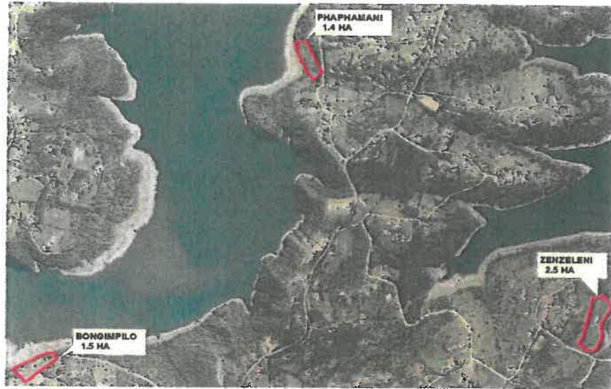
Figure 1: Locality map for Inchanga Pumping units

The above-mentioned schemes are existing schemes with irrigation systems, but the pumping units are broken therefore unable to producing vegetable. (The schemes are producing winter and summer vegetables)