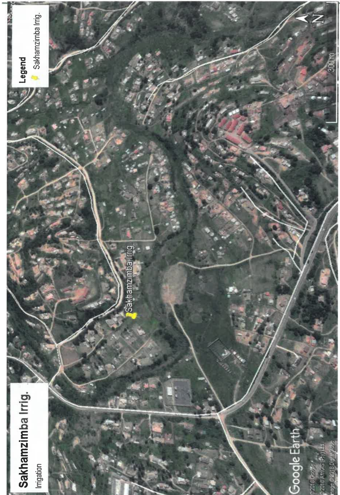
Supply & install: 0.5ha irrigation scheme at Sakhamzimba Garden: Inchanga sub district - June 2018